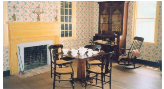
Newly installed wallpaper for the parlor