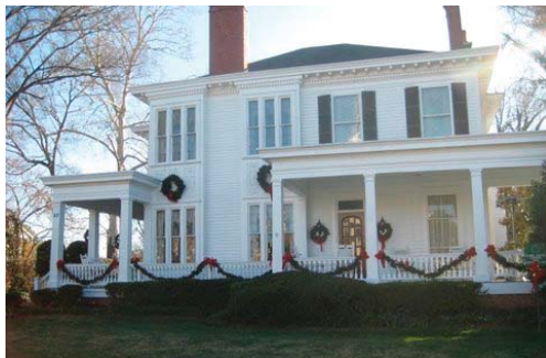
The Whitlock Inn