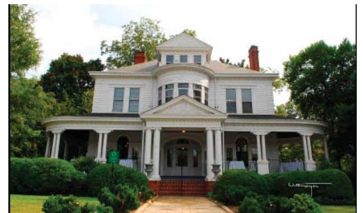
The Anderson House