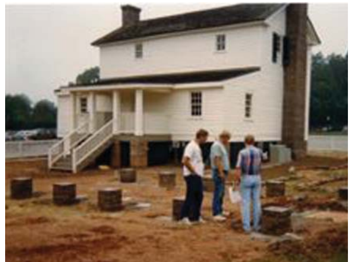
The piers for the detached kitchen house being inspected

Cobb Landmarks is currently contacting the local school systems in an effort to line up fieldtrips for this spring and the 1997/1998 school year. We have already scheduled two schools for this Spring. When we have a full schedule of fieldtrips we will expand the docent training program to include how to give a tour to school children. We envision giving you, the docent, all the facts, letting you watch the tour being given by several individuals, and then letting you develop your segment of the tour by using what you feel is most interesting. This gives each tour a personal touch and allows the docent's enthusiasm for the subject to come through.