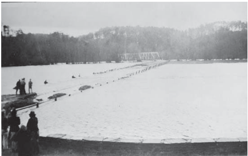
The flooded bridge in 1946

Johnson Ferry Road was likely in existence before the Civil War. It is noted as having been used by Federal troops as they traveled from Marietta to the mills in Roswell. The road was not paved until after 1946, when, in June of that year, Cobb voters passed a $1.4 million bond referendum. The money was used to pave over one hundred miles of roads in Cobb County, including Johnson Ferry Road. These improvements were made after serious flooding occurred in the county in January 1946. The Johnson Ferry Road bridge crossing the Chattahoochee River was surrounded by flood waters.