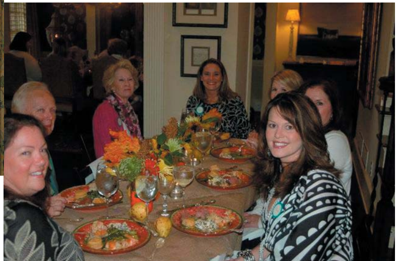
Guests enjoying the delicious brunch fare